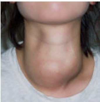
Before STARmed RFA Procedure