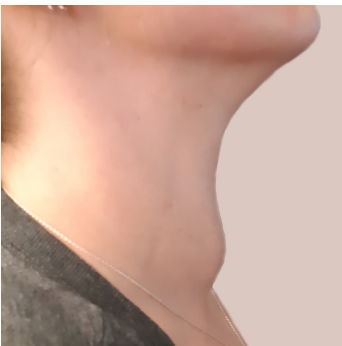
Before STARmed RFA Procedure